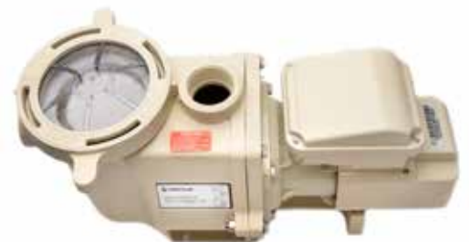
WhisperFlo High Performance Pump

These pumps are the result of our 40 years delivering superior performance and earning the industry's critical acclaim.