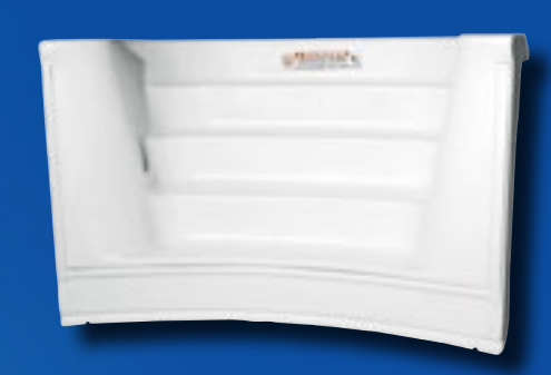
Available with the 48" curved step.