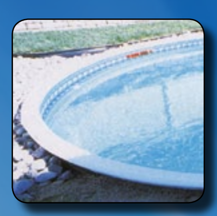
Special coping suitable for easy winterizing with the "fitted winter cover."