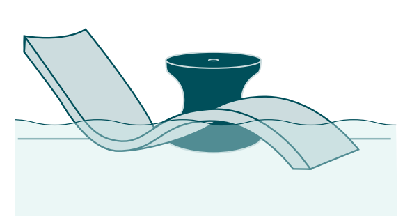
Once your Ledge Lounger<sup>™</sup> Chaise and/or Table is filled with water, pull it back onto the ledge in the desired position.