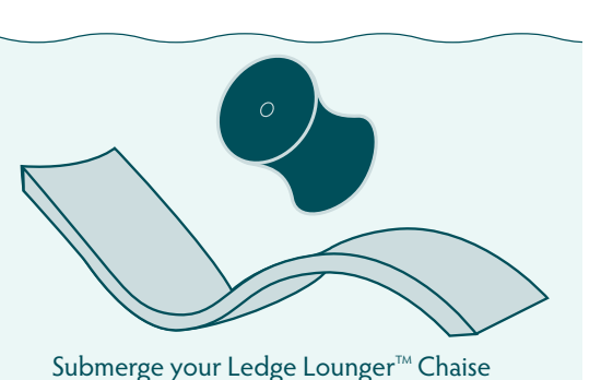
and/or Table in the pool and fill completely with water. Try to remove all the air bubbles.

CONGRATULATIONS! You are the proud owner of a new Ledge Lounger<sup>™</sup> product. Below are some tips about placement and care. After the Lounger is positioned just right, don't forget to send us a picture! If you have any questions, feel free to contact us: info@ledgeloungers.com, or visit us: LEDGELOUNGERS.COM .