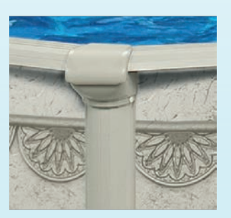
Ledge, cap and post designed for a secure fit