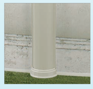
One-piece resin foot collar