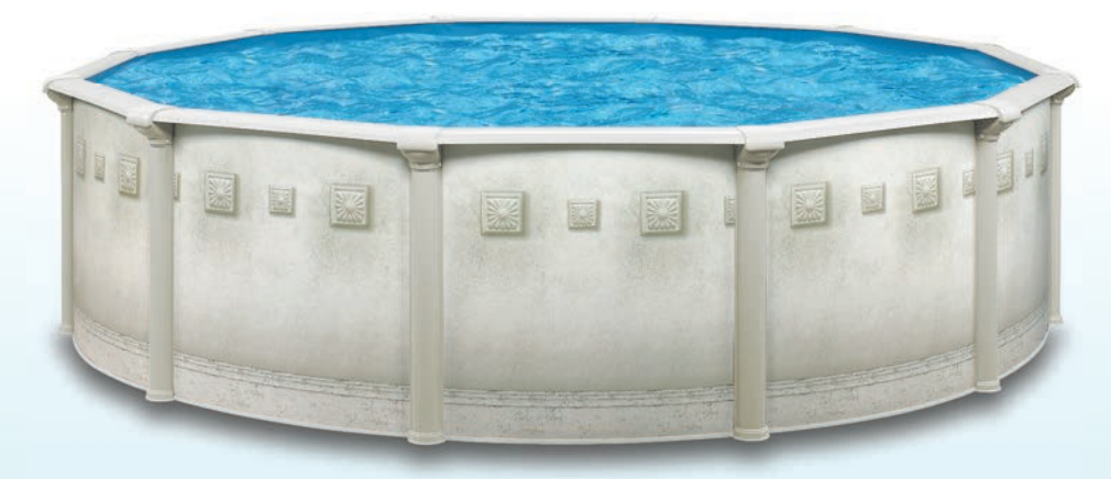
Round Millenium - Tuscan wall offered in 52 inches