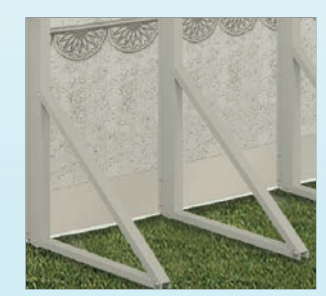
Heavy-duty angle brace system