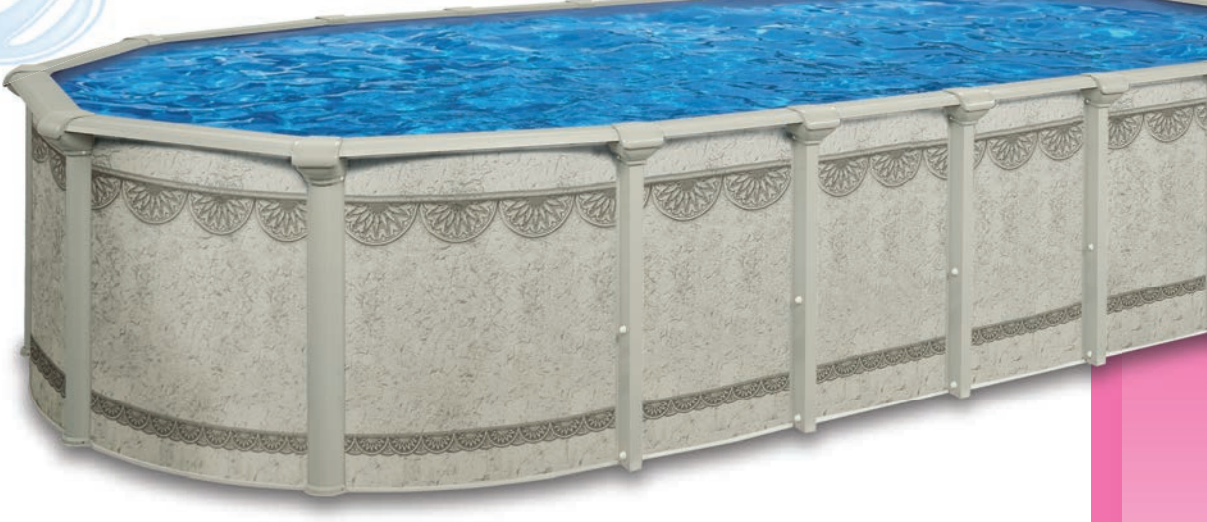
NBS oval Millenium - Khaki Maya wall offered in 52 and 54 inches