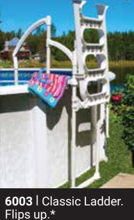
701-0076 / 5050_EN REV01/20 AVAILABLE: QC | CAN | INT

This model can also be installed with the Classic Ladder 6003 (non regulatory in Quebec) or the Self-Latching Ladder 9600 on a pool with no deck.