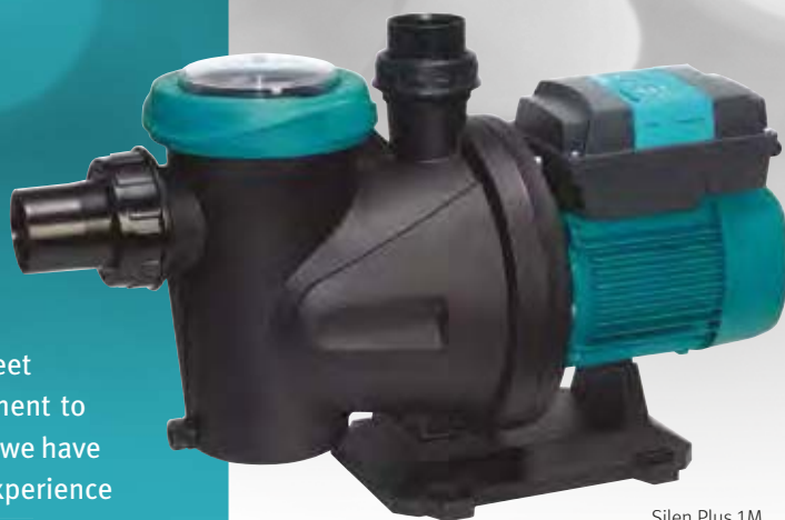
Silen Plus 1M

evopool ® means progress, and as such it will now encompass all the improvements and innovation that ESPA has been developing and introducing in its products and applications for pools. It always guarantees maximum efficiency and sustainable treatment of energy resources. Today and in the future, ESPA is evopool ® .