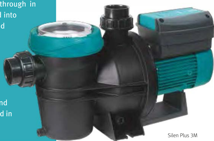
Silen Plus 3M