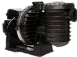
Max-E-Pro High Efficiency Pool Pump