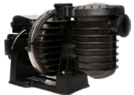
Max-E-Pro High Efficiency Pool Pump