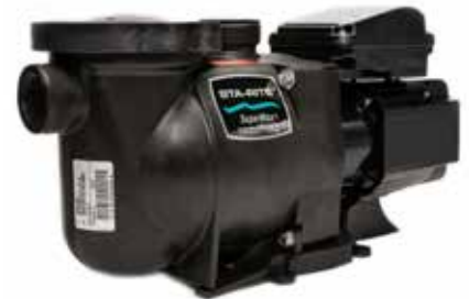
SuperMax High Performance Pump

Known for high performance, energy smarts, easy upkeep, and proven reliability.