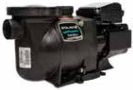
SuperMax High Performance Pump